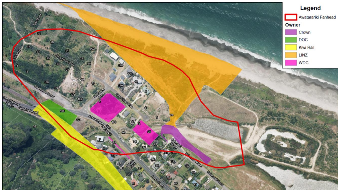
Figure 3 High Debris Flow Risk Area

will apply to the ten properties in public ownership. Of the remaining 35 land parcels, 16 contain occupied dwellings and 19 are vacant sections. A map of the 45 land parcels with the public land highlighted is provided in Figure 3.