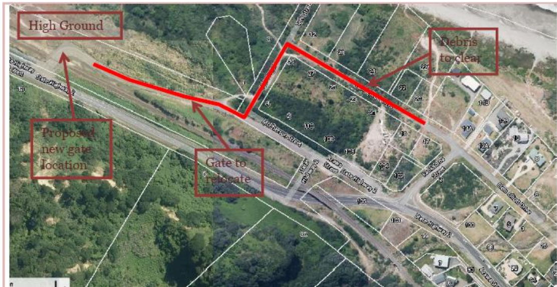
Figure 1 Proposed Escape Route

Providing Clem Elliott Drive residents with an additional narrow metalled vehicular escape route along unformed public roads delivers an immediate life safety benefit at minimal cost.