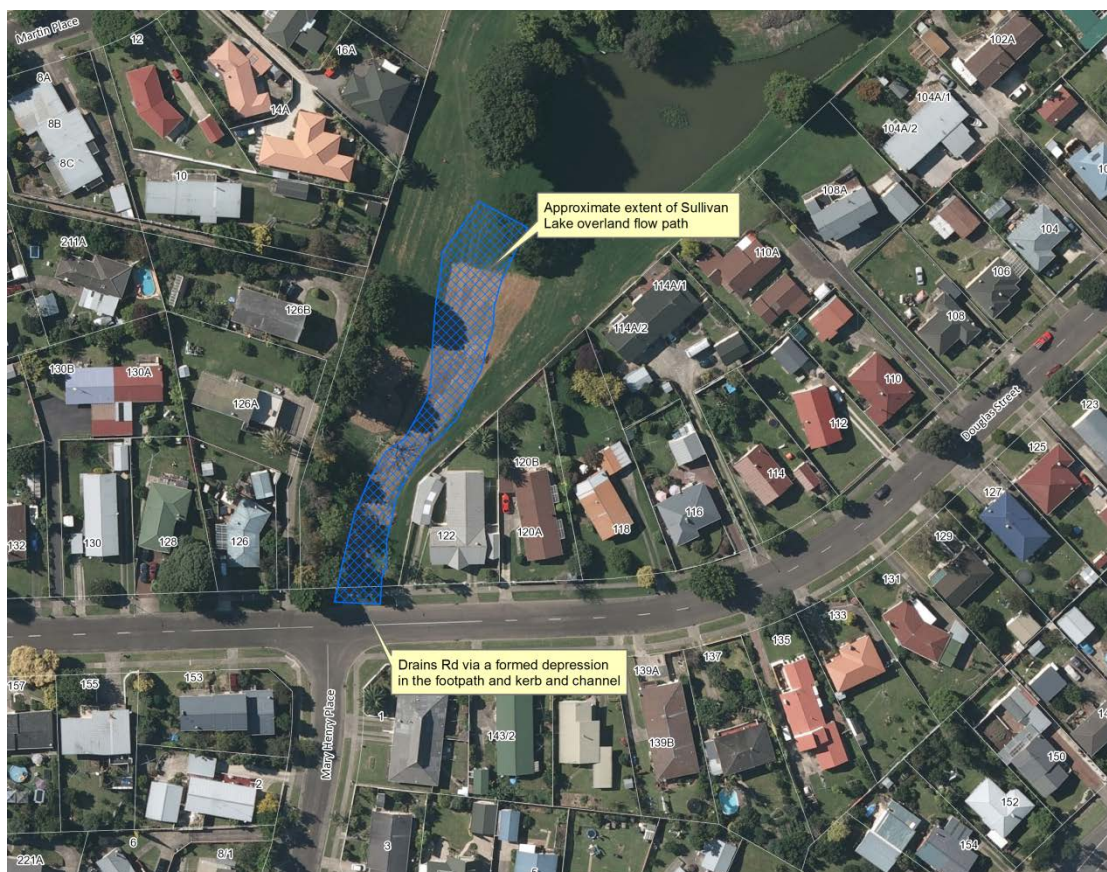
Figure 2: Sullivan Lake - overland flow path

Sullivan Lake acts as an intermediary receiving environment for stormwater runoff before it enters the Whakatane River. It provides buffer storage and attenuates peak flow runoff to the St Joseph drain. In addition, the lake acts as a sediment deposition environment. The silt traps along Valley Road are an inherent part of the system and require regular maintenance to reduce the volume of coarse sediment flowing into the lake. Sullivan Lake provides the trap for the fine sediments as these require a large flat area in which to settle. A bund is maintained at the southern end of the lake to aid in the capture of sediment. The silt is more manageable from that location and its removal is currently scheduled on an irregular basis. In addition to stormwater piping infrastructure, the reserve also provides stormwater overland flow relief at its southern end. This is in the form of a shallow swale connected from Douglas Street (near Mary Henry Place). This system allows water to spill into the reserve during intense rainfall events when the piped network is overwhelmed. This is an integral part of the stormwater system and provides flood relief to residential properties in the area. This overland flow path is provided for in the District Plan and delineated on planning maps.