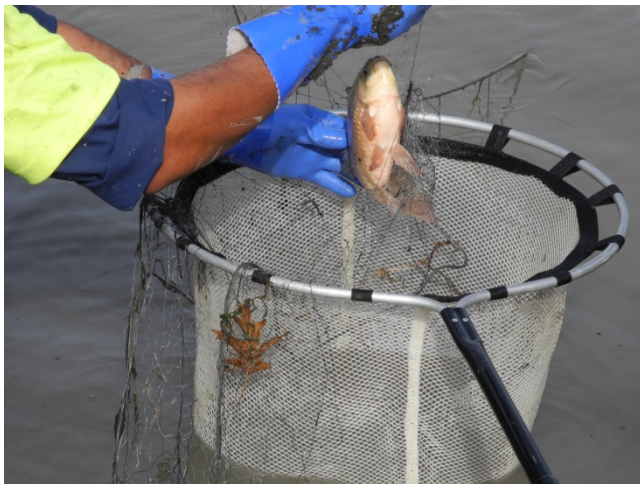
Goldfish in Sullivan Lake

The fish population includes gambusia, a mosquitofish introduced to the Pacific by the Americans during World War II. These small fish probably make up a large portion of the diet of the small shag species. Goldfish ( Carassius ) are also present in large numbers, and are often mistaken for Koi Carp due to their large size. Eels, which obtain access from the river through the outlet weir as elvers, are also present.