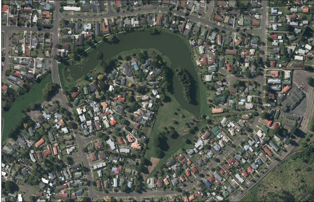
Aerial Photo Sullivan Lake Reserve Figure 1

Sullivan Lake Reserve is located within the urban area of Whakatane commonly referred to as City South. To the west, it borders King Street, to the south Douglas Street and Martin Place and the northern and eastern areas of the reserve border residential properties on Olympic Drive and Lakeview Place. Access to the lake and reserve is gained directly off King Street and Douglas Street. In addition, there are access ways to the reserve from Martin Place, Douglas Street and Olympic Drive.