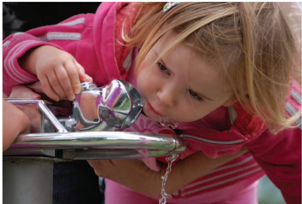
“Drinking fountains throughout Whakatane are safe, convenient, litter-free and save the communtiy money”

The Council has adopted the Whakatane Integrated Urban Growth Strategy which is based on the population of the Whakatane urban area being 25,000 in 2050. The strategy aims to provide a framework to ensure that this growth is managed. If the urban population is to double over the next 40 years, this will require a growth rate of 0.92 percent per annum, significantly greater than the growth rate experienced by the area over the last 20 years of 0.6 percent per annum. Through the development of the Integrated Urban Growth Strategy, alongside this Sustainability Strategy, the Council is working to ensure that this growth occurs in a sustainable manner.