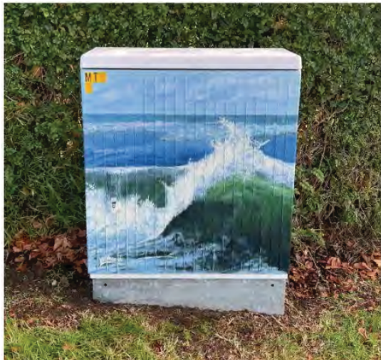
Photo caption: Artwork completed in July 2024 by Lori Pittard – located on Pakeha Street in Matatā.

Whakatāne District Council has teamed up once again with Chorus to bring works of art to a neighbourhood near you.