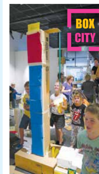
Plenty of eager children took advantage of Te Kōputu's Free School Holiday programme last month. Box City gave children an opportunity to design and display their own cardboard creations.