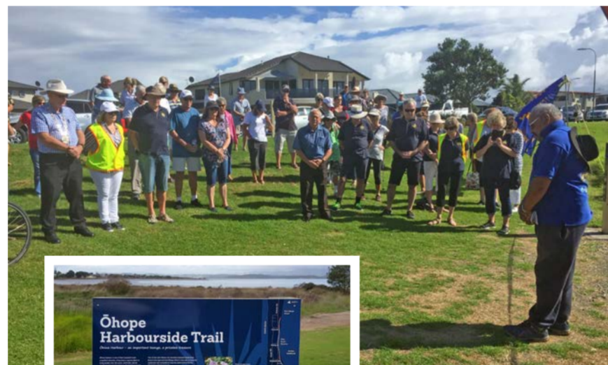
The new Ōhope Harbourside Trail is blessed to signal its official opening

The Whakatāne District's latest walking and cycling asset was officially opened last weekend, marking the completion of a long-held dream of making the changing moods and estuarine beauty of the Ōhiwa Harbour more accessible to the community.