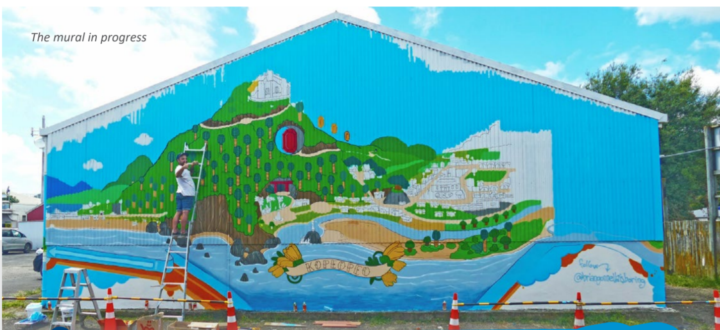
The mural in progress

Visit whakatane.com/events to find out more