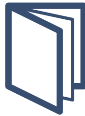
ANNUAL BUDGET UPDATE

Regardless of whether or not you are a ratepayer, the Long Term Plan affects us all. It is more than just a work plan for the Council. It is about working towards the kind of community and District we want to live in, and a future we want to be a part of.