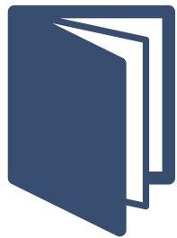
LONG TERM PLAN (THIS DOCUMENT)

The Long Term Plan sets Council's strategic direction, priorities and work programme for the ten years ahead. It outlines the services we will provide, the projects we will undertake, the cost of doing this work, how it will be paid for and how we will measure our performance.