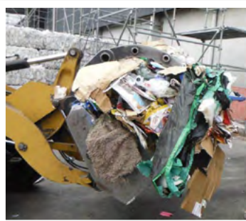
Yellow-lid bins were contaminated with non-recyclables, including blankets, dirty nappies and deer legs.

You can deliver extra rubbish to the Murupara Transfer Station on Harakeke Road for FREE.