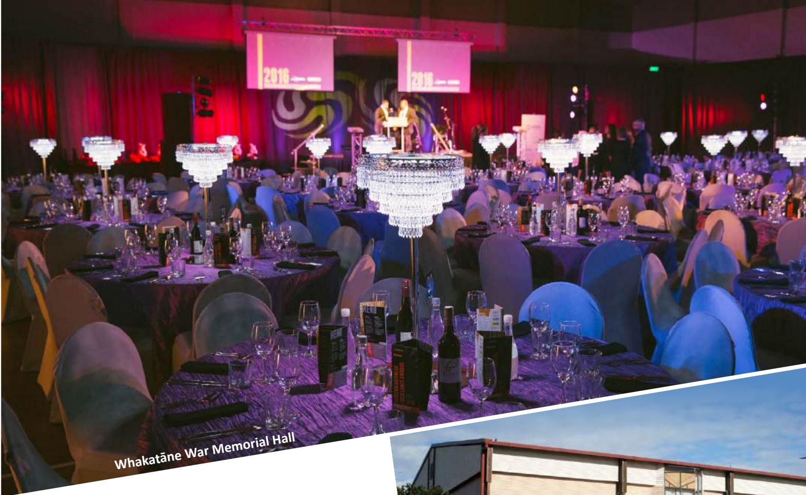
Whakatāne War Memorial Hall